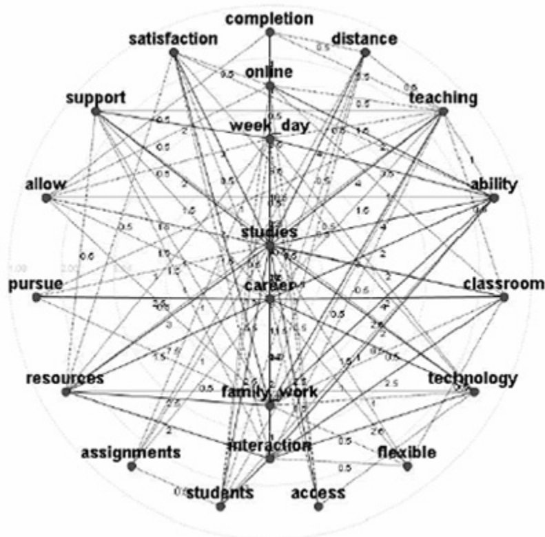
Figure 1: Students’ Views on ALN [83]

Back in 1967, when The Beatles’ working class heroes found school inhospitable, less attention was paid to student satisfaction. Today we are realizing that satisfaction with all aspects of the learning experience—academic challenge, fairness, and relevance; substantive, constructive interaction; support services and resources—motivates people to continue studies. Improving success rates in the still young field of ALN depends on understanding and rewarding learners’ perspectives.