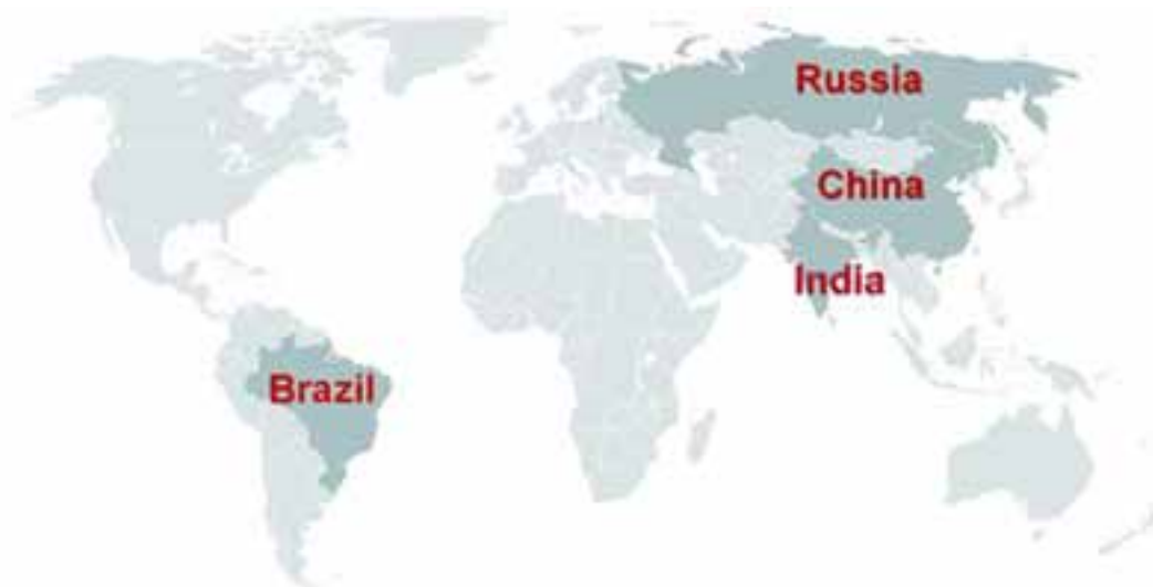
Figure 1. The BRIC Nations of Brazil, Russian Federation, India, and China are Recognized as the Next Leading Forces in the Global Economy.

UNICEF (n.d.) provides statistics on all of the BRIC nations as noted in Table 2 for years 2004 and 2005. Three of the BRIC nations—Brazil, China, and the Russian Federation—are represented in statistical gathering of World Education Indicators (WEI or WEI Programme), as indicated for years up to 2003. The WEI Programme includes 16 other countries, as well, for what the sponsoring organizations call coverage of “over 70% of the world’s population” [41].