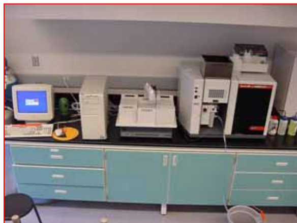
Figure 1. The WWU FAAS System Used Remotely by Pharmacy 325 Students in Lecture and Laboratory Components of the Course

exchange between the WWU faculty and UBC students and faculty member at all times during the introductory session as well as subsequent guest appearances. To support the new laboratory activities, later in the course the WWU faculty member traveled to the UBC campus to present a “live” lecture on the principles of atomic absorption spectroscopy as well as a remote demonstration of the FAAS system. (Figure 1). The UBC campus is approximately 70 miles north of the WWU campus, across the US/Canada border. This live lecture presentation provided students with an example of how the device would be used during the laboratory, presented students with the opportunity to interact with the WWU faculty member prior to conducting the remote experiments and helped capture the excitement and uniqueness of the ILN learning opportunity for students in the course.