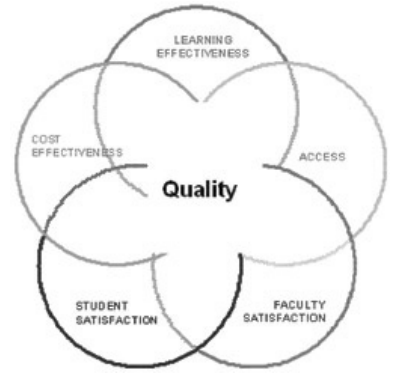
Figure 1. The five pillars of online learning.

In the more than ten years that methods for online education have been studied, much has been learned [10]. Prior to that time, distance education was limited to correspondence courses and televised lectures, although research about using computers in education had been actively pursued for some decades [11, 12]. Much of this work is reviewed in an earlier paper by the authors [13]. Indeed, the study of online engineering education methodologies has been conducted both in the United States and throughout the world [14], but is by no means completely understood today.