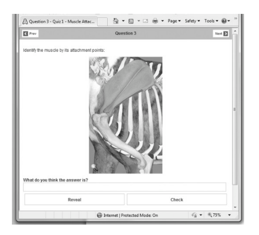
Figure 2. Quiz question 1. The image was found in the traditional reading assignment.

Figure 1. Screen-shot of an example of a quiz question contained within the anatomy app. An answer can be generated by either: 1) typing an answer into the text-input box and receiving automatically graded input on your typed answer by tapping the "Check" button; or 2) by tapping on the "Reveal" button.